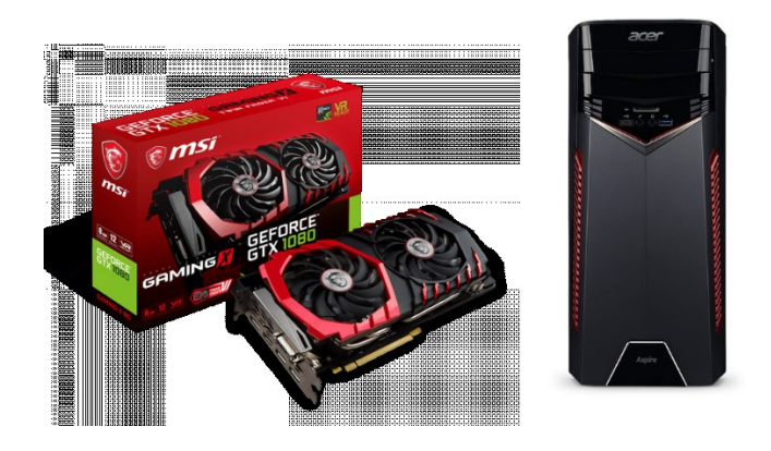
Figure 4 Graphical card and strong computer for VR