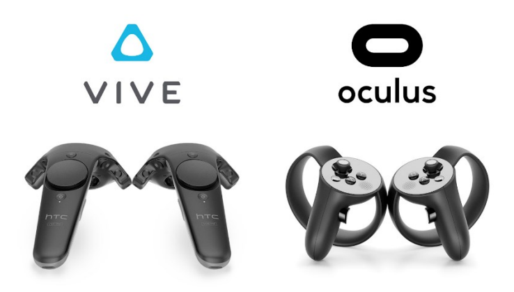
Figure 2: Input device HTC Vive and Oculus Rift - hand controls examples

Input devices provides users the sense of immersion and determines the way a user communicates with the computer. It helps users to navigate and interact within a VR environment to make it intuitive and natural as possible. Most commonly used input devices are joysticks, force Balls/Tracking balls, controller wands, data gloves, trackpads, on-device control buttons, motion trackers, bodysuits, treadmills and motion platforms (virtual omni).