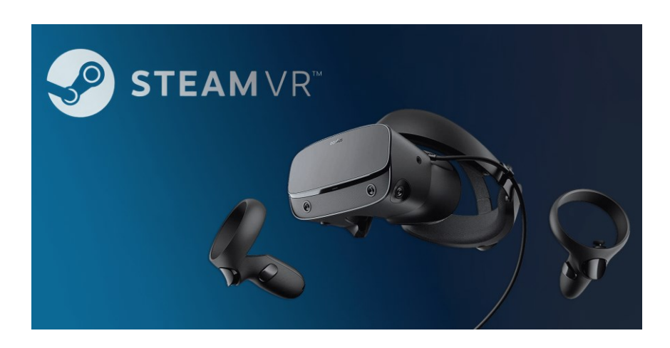
Figure 4: Software STEAM VR

Currently there are two leading commercial platforms on the market: OCULUS and HTC VIVE (STEAM VR). Both platforms offers apps, games and other virtual reality experiences (free and for purchase). Platforms are daily updated with new content (software) and hardware (firmware) updates and bug fixes. Virtual reality apps usually requires large amount of disk space (aprox. 20-30 gb) . We also know other non-commercial VR platforms that are developed for individual customers.