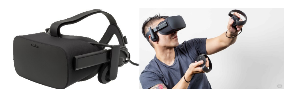
Figure 3: VR output device Oculus Rift HMD example

Oculus Rift is a lineup of virtual reality headsets developed and manufactured by Oculus VR, a division of Facebook Inc., released on March 28, 2016. Oculus maintains a market place for applications for the headsets. The listings are curated to only allow applications that run smoothly on the recommended hardware. Most listings are also rated on their comfort level based on their likelihood of causing motion sickness or number of jump scares. The Oculus Rift runtime officially supports Microsoft Windows, macOS, and GNU/Linux. The installation package includes components such as the headset driver (which includes Oculus Display driver and controller drivers), Positional Tracking Sensor driver, Oculus Service, and Oculus Home Application.