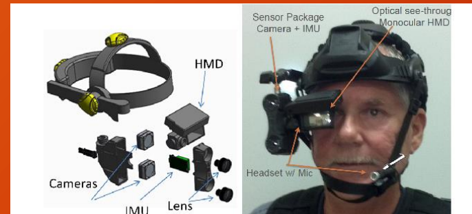
Figure 2: The human wearable helmet-based sensor package with OST display.